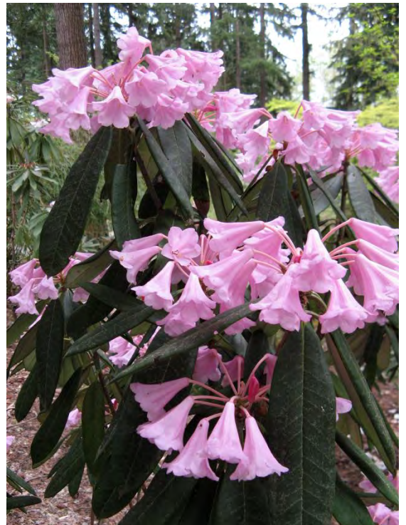
R pingianum ... RSBG, April 2010