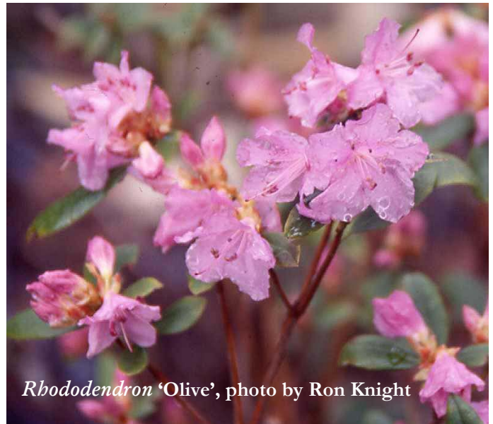
Rhododendron 'Olive'