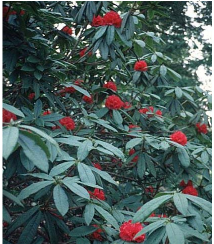
Rhododendron barbatum , a native of Nepal, Sikkim, Bhutan and S. Tibet, 2700 – 3700 m elev